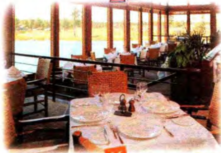
At the restaurant